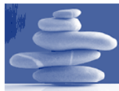
Bockelie Law Office, L.C.