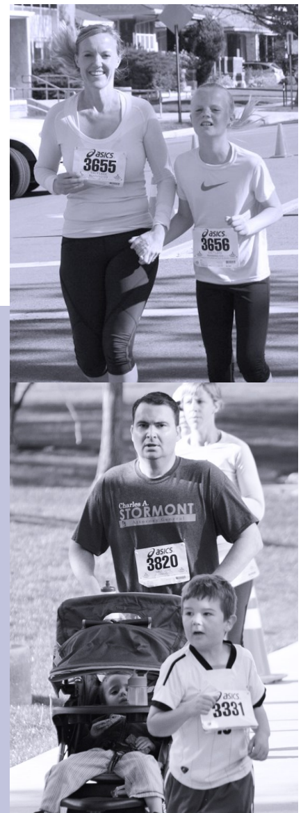
Law Day Run 2014

We look forward to providing more information on these efforts as they progress via our blog, e-newsletters and Facebook page; for more info like us on Facebook or sign up for our e-mail list at andjusticeforall.org/ newsletter